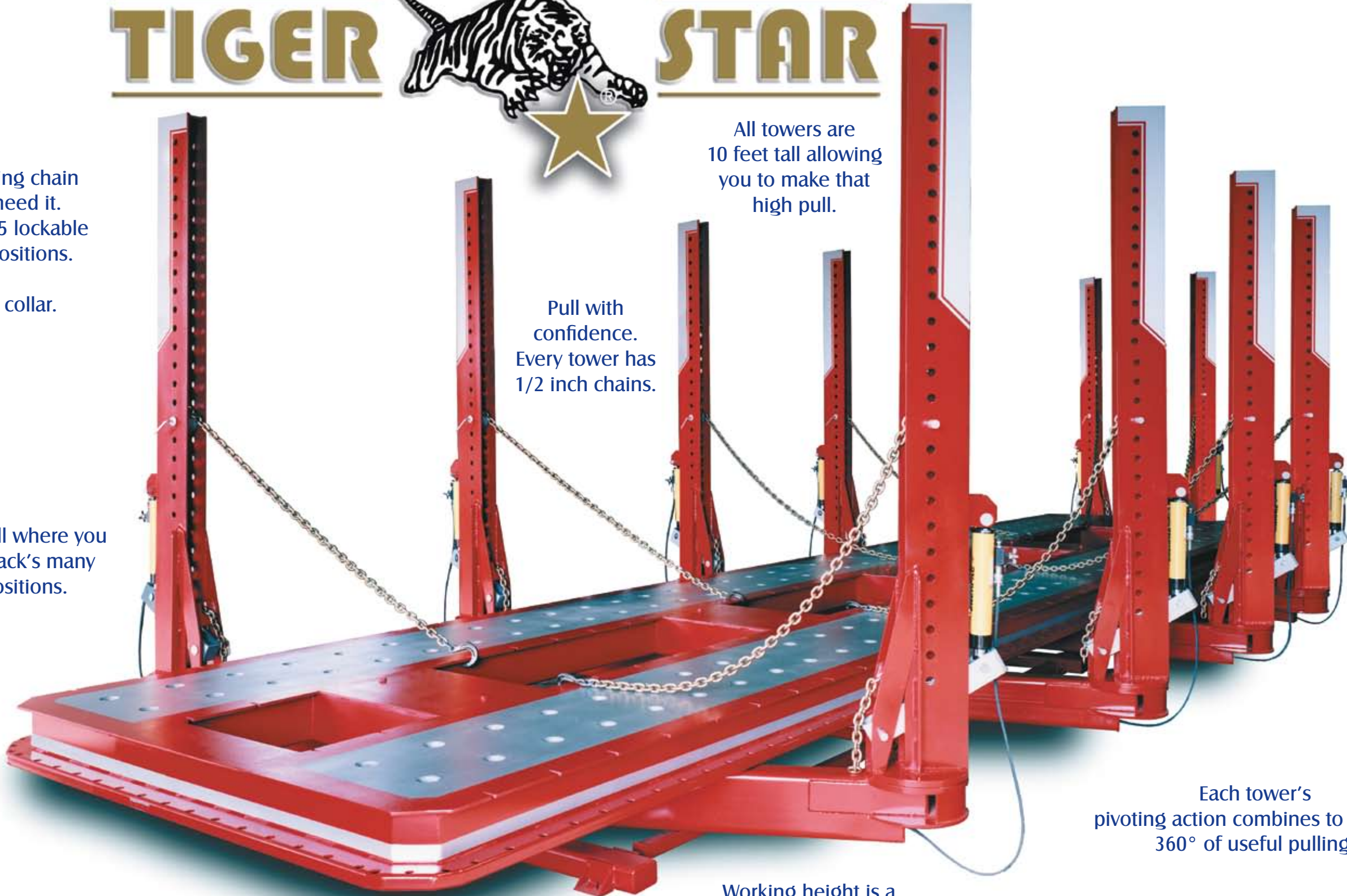
Tiger Star 40 foot model

Working height is a comfortable 26 inches.